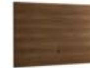
BACK PANEL FOR TV BASE KJME633NC inch W 65" D 1" H 43" cm L 165 P 1,8 H 109,6 Crts 1 kg 23 m 3 0,16