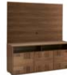
WALL UNIT COMPOSITION 4 PJME0703NC With TV base and back panel inch W 65" D 19" H 73" cm L 165 P 48,9 H 184,2 Crts 2 kg 95 m 3 0,89