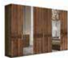
6/D SWINGING WARDROBE (wooden doors) (with 2 mirrors) PJME0017NC

With 4 doors, 2 shelves and 4 hanging rods inch W 77* D 25* H 90* cm L 196,5 P 62,7 H 227,5 Crts 8 kg 191/208* m 3 0,64/0,67*