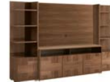
WALL UNIT COMPOSITION 2 PJME0701NC With TV base, back panel, 2 library bookcases inch W 109" D 19" H 73" cm L 277,8 P 48,9 H 184,2 Crts 4 kg 203 m 3 1,63