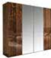
4/D SWINGING WARDROBE (wooden doors) (with 2 central mirrors) PJME0013NC

With 3 doors, 2 shelves and 4 hanging rods inch W 58* D 25* H 90* cm L 147,6 P 62,7 H 227,5 Crts 8 kg 165/173* m 3 0,60