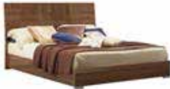
Q.S./UK 5" BED PJME0150NC

With walnut canaletto h.g. structure, seat in ecoleather inch W 20* D 22* H 42* cm L 50 P 56 H 105,5 Crts 1 kg 12 m 3 0,23