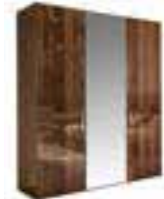
3/D SWINGING WARDROBE (wooden doors) (with central mirror) PJME0011NC

With 2 doors, 1 shelf and 2 hanging rods inch W 39* D 25* H 90* cm L 98,8 P 62,7 H 227,5 Crts 5 kg 99 m 3 0,42