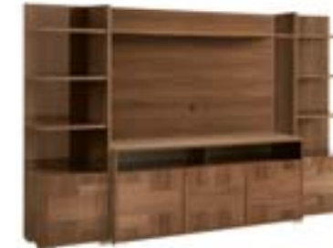
WALL UNIT COMPOSITION 1 PJME0700NC With TV base, back panel, shelf, 2 library bookcases inch W 109" D 19" H 73" cm L 277,8 P 48,9 H 184,2 Crts 5 kg 213 m 3 1,7