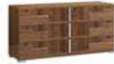
3/DRW. DRESSER KJME121NC

inch W 67* D 20* H 31* cm L 170 P 50,7 H 79,7 Crts 1 kg 75 m 3 0,80