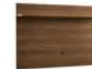
BACK PANEL WITH SHELF FOR TV BASE PJME0710NC Space for TV in height: 34 1/4" - 87 cm inch W 65" D 13" H 43" cm L 165 P 33,5 H 109,6 Crts 2 kg 33 m 3 0,22