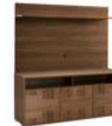
WALL UNIT COMPOSITION 5 PJME0704NC With TV base, back panel and shelf inch W 65" D 19" H 73" cm L 165 P 48,9 H 184,2 Crts 3 kg 105 m 3 0,95