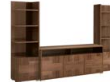
WALL UNIT COMPOSITION 3 PJME0702NC With TV base, 2 library bookcases inch W 109" D 19" H 73" cm L 277,8 P 48,9 H 184,2 Crts 3 kg 180 m 3 1,47