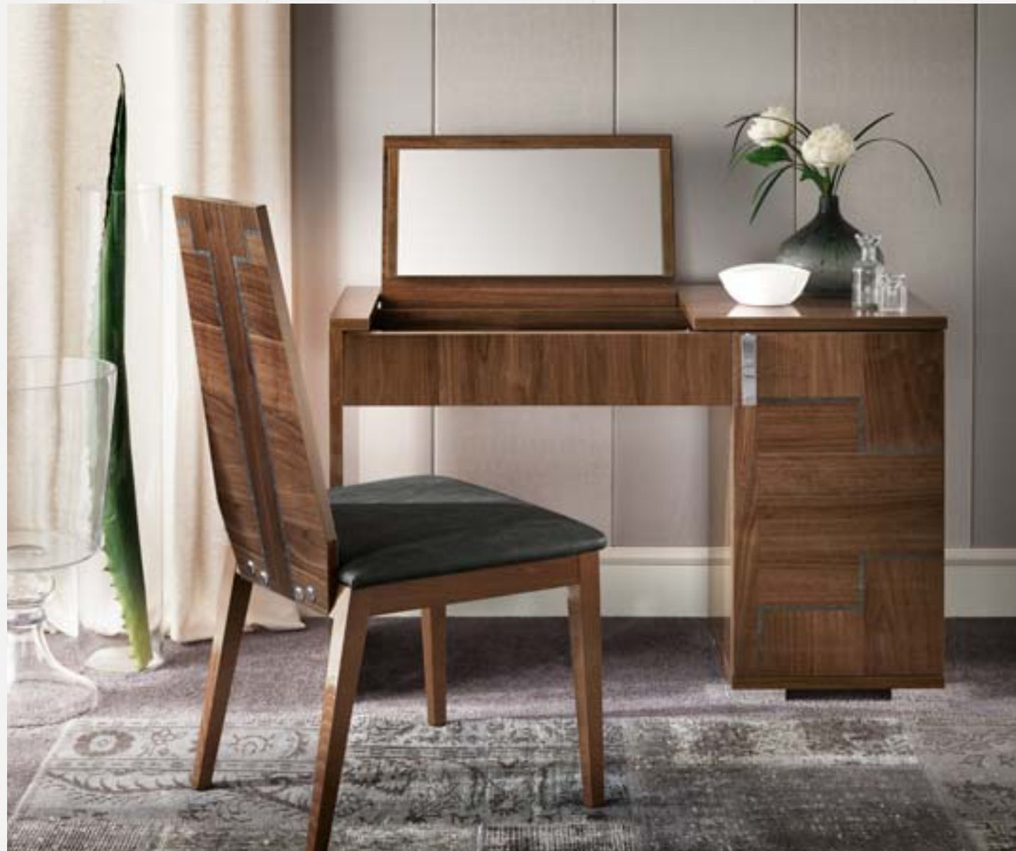
The “Vanity” is the ideal furnishing accessory in a bedroom devised to afford maximum functionality.