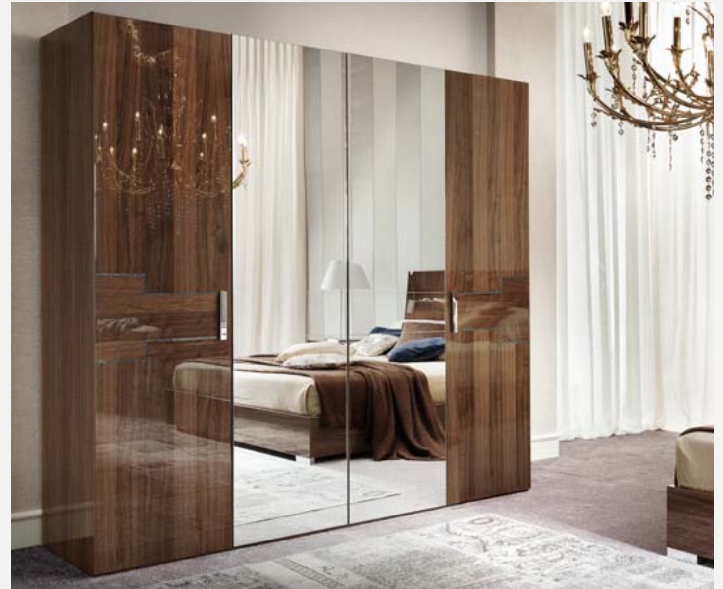
Plenty of storage space and ample modularity for the wardrobes, available in the wood veneer or with external mirrors.