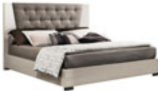
Q.S./UK 5" BED PJMB0150/ PJMB0250

inch W 39" D 1" H 42" cm L 100 P 2,1 H 107 Crts 1 kg 20 m 3 0,10