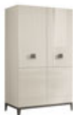
2/D SWINGING WARDROBE PJMB0009

WITH wooden headboard PJMB0294 inch W 81" D 87" H 51" cm L 206 P 221 H 129,9 Crts 2 kg 104 m 3 0,36