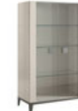
2/D CURIO PJMB0600

inch W 20" D 17" H 73" cm L 51,5 P 44 H 184,7 Crts 2 kg 58 m 3 0,20