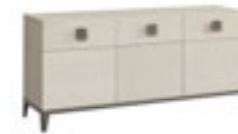
3/D BUFFET KJMB610KT With 3 doors and cutlery drawer

inch W 68" D 19,7" H 32" cm L 173,2 P 49,9 H 82 Crts 1 kg 78 m 3 0,73