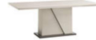
EXTEN. DINING TABLE PJMB0615

inch W 68" D 19,7" H 32" cm L 173,2 P 49,9 H 82 Crts 1 kg 78 m 3 0,73