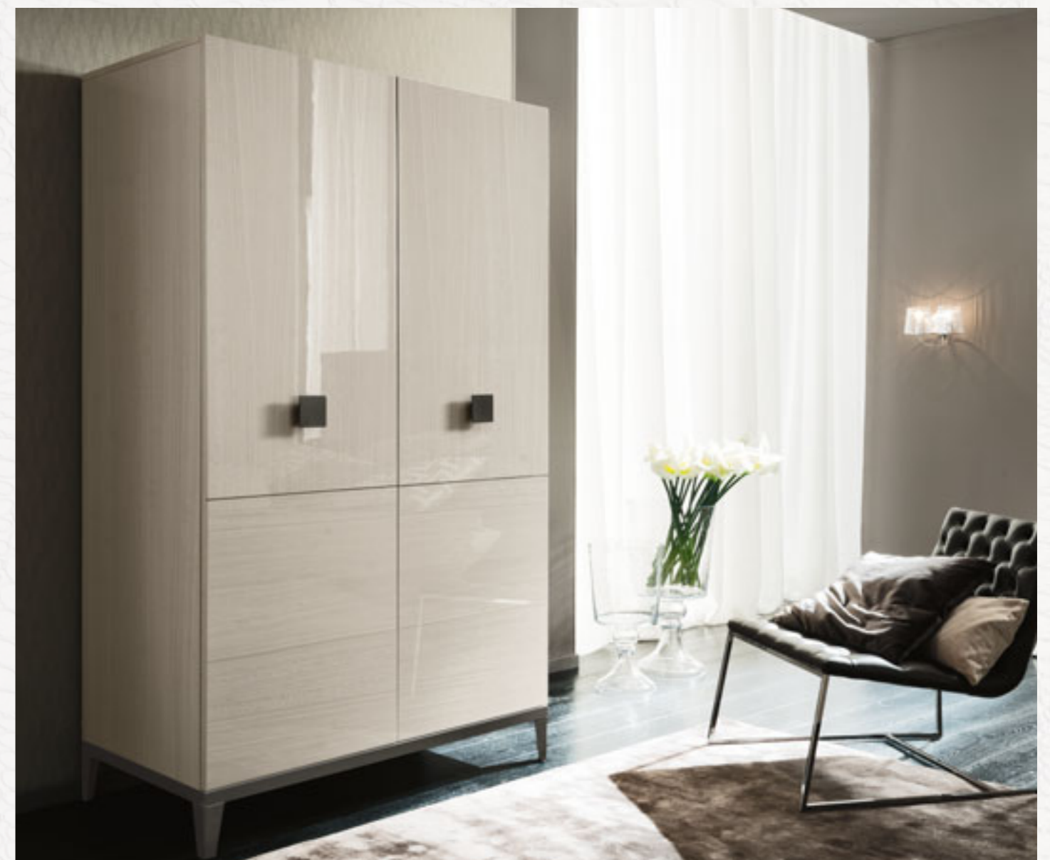
Generous internal spaces and ultimate versatility for the wardrobes with two or three swinging doors.