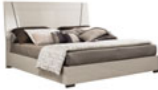
K.S./UK 6.6" BED PJMB0175/ PJMB0275

WITH wooden headboard PJMB0250 inch W 68" D 87" H 51" cm L 171,5 P 221 H 129,9 Crts 2 kg 92 m 3 0,32