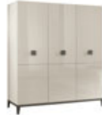
3/D SWINGING WARDROBE PJMB0010

With 2 doors, 1 shelf and 2 hanging rods inch W 44" D 25" H 77" cm L 110,6 P 63,5 H 195 Crts 3 kg 106 m 3 0,37