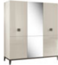
3/D SWINGING WARDROBE PJMB0011

With 3 doors, 2 shelves and 4 hanging rods inch W 66" D 25" H 77" cm L 166,4 P 63,5 H 195 Crts 5 kg 160 m 3 0,58