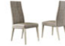
2 CHAIRS KJMB620KT

inch W 81" D 41" H 30" cm L 205 P 105 H 75,9 Crts 2 kg 102 m 3 0,59