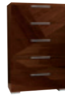
5/DRW. CHEST KJCA115CN With 5 drawers

inch W 30" D 17" H 23" cm L 75 P 44 H 57,2 Crts 1 kg 37 m 3 0,26