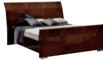
Q.S./UK 5" BED PJCA0150CN Inner size inch 61 1/2" x 81 1/2"

inch W 45" D 1" H 42" cm L 114 P 2,8 H 106,2 Crts 1 kg 28 m 3 0,09