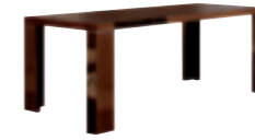
EXTEN. DINING TABLE PJCA0615CN With 2 leaves: W 117", cm 295 (1 leaf 18", cm 45) inch W 81/117" D 41" H 30" cm L 205/295 P 105 H 2 76,3 Crts 2 kg 120 m 3 0,41