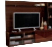
ENTERT. CENTER PJCA0632CN With 2 doors sliding base, 1 door column, shelves inch W 73" D 22" H 70" cm L 185 P 56 H 2 177 Crts 3 kg 166 m 3 0,99