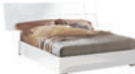
QUEEN SIZE BED PJAS0150

inch W 40" D 1" H 43" cm L 100 P 2,1 H 107 Crts 1 kg 25 m 3 0,074