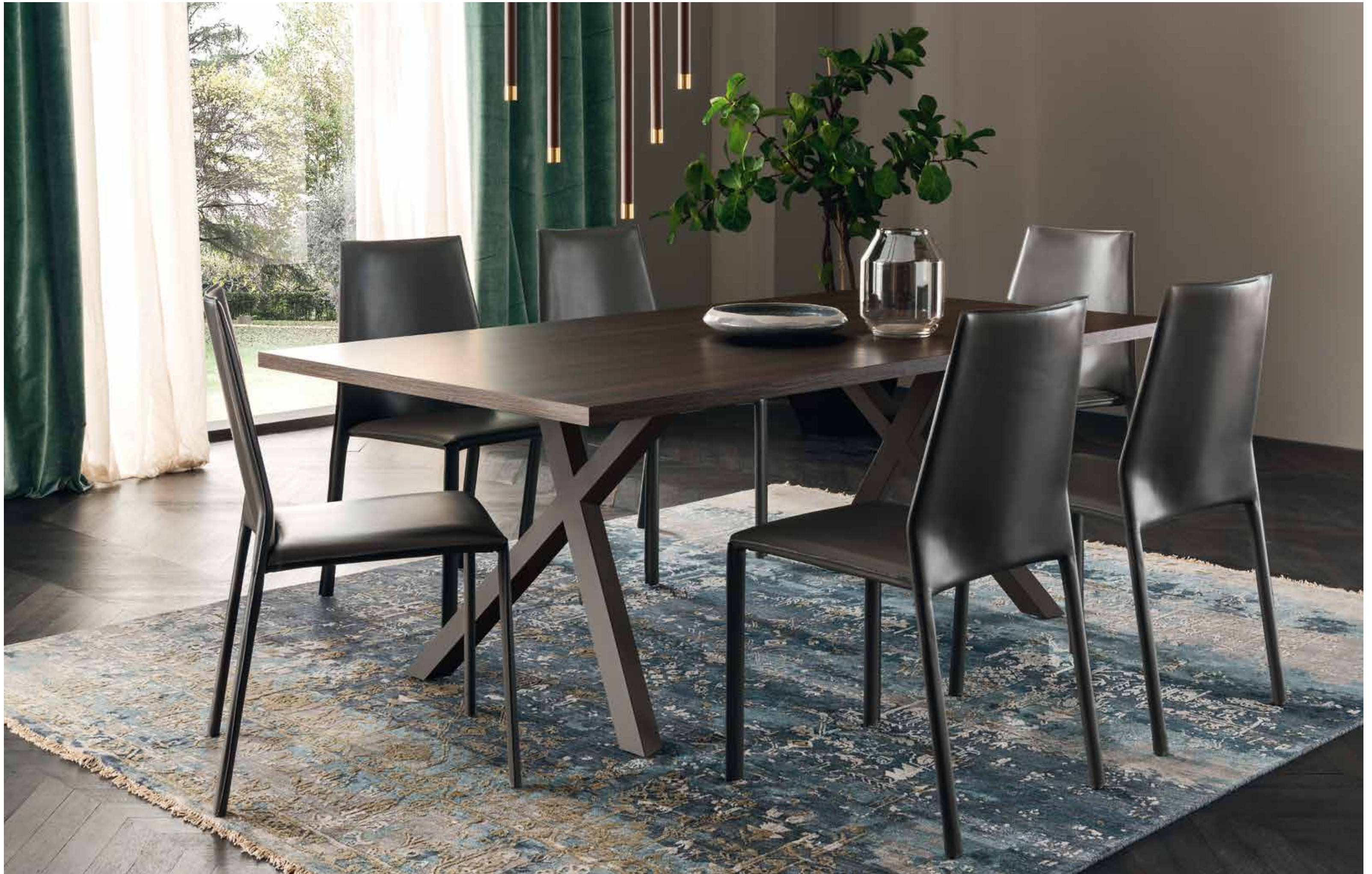
Sedie Corium: for this article please see "COMPLEMENTS" Alf DaFrè